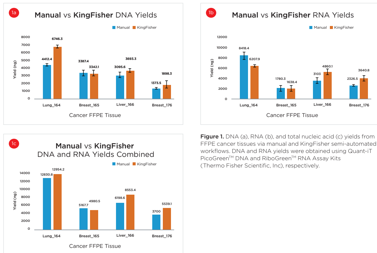
Figure 1. DNA (a), RNA (b), and total nucleic acid (c) yields from FFPE cancer tissues via manual and KingFisher semi-automated workflows. DNA and RNA yields were obtained using Quant-iT PicoGreen™ DNA and RiboGreen™ RNA Assay Kits (Thermo Fisher Scientific, Inc), respectively.